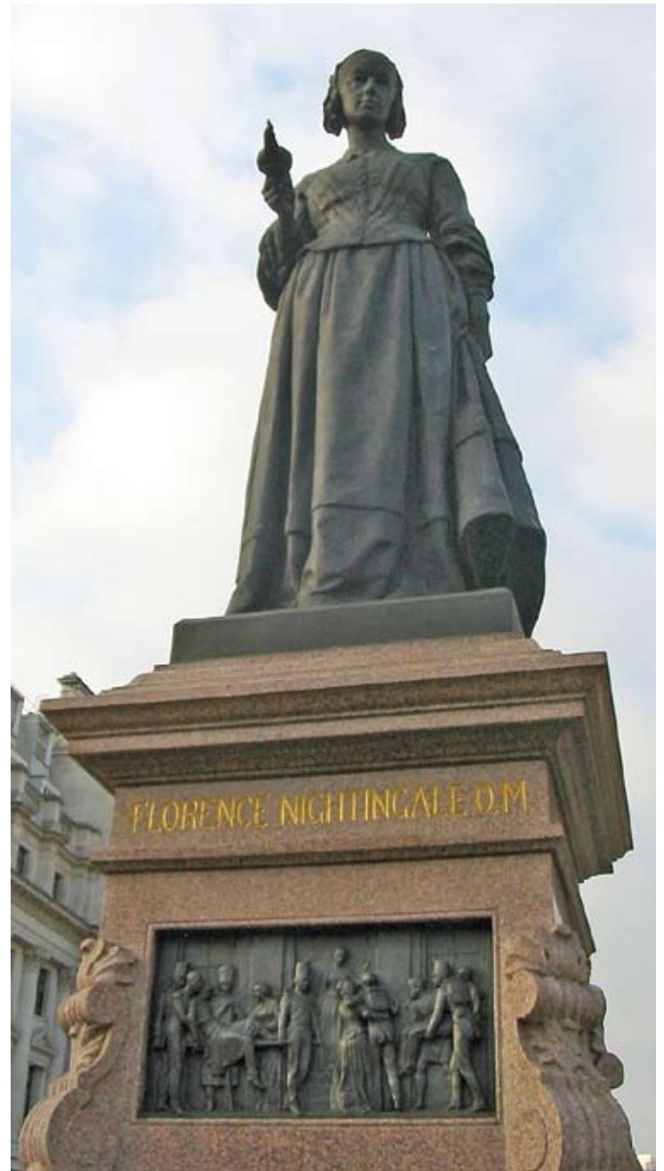
Florence Nightingale monument, London