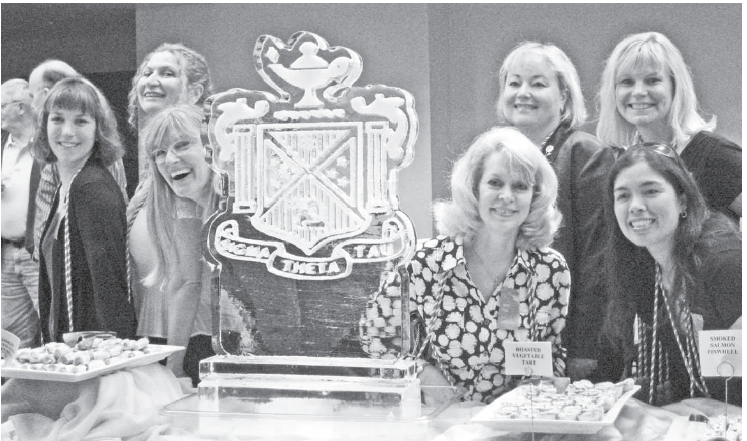
New Inductees and STTI Ice Sculpture at Induction Reception