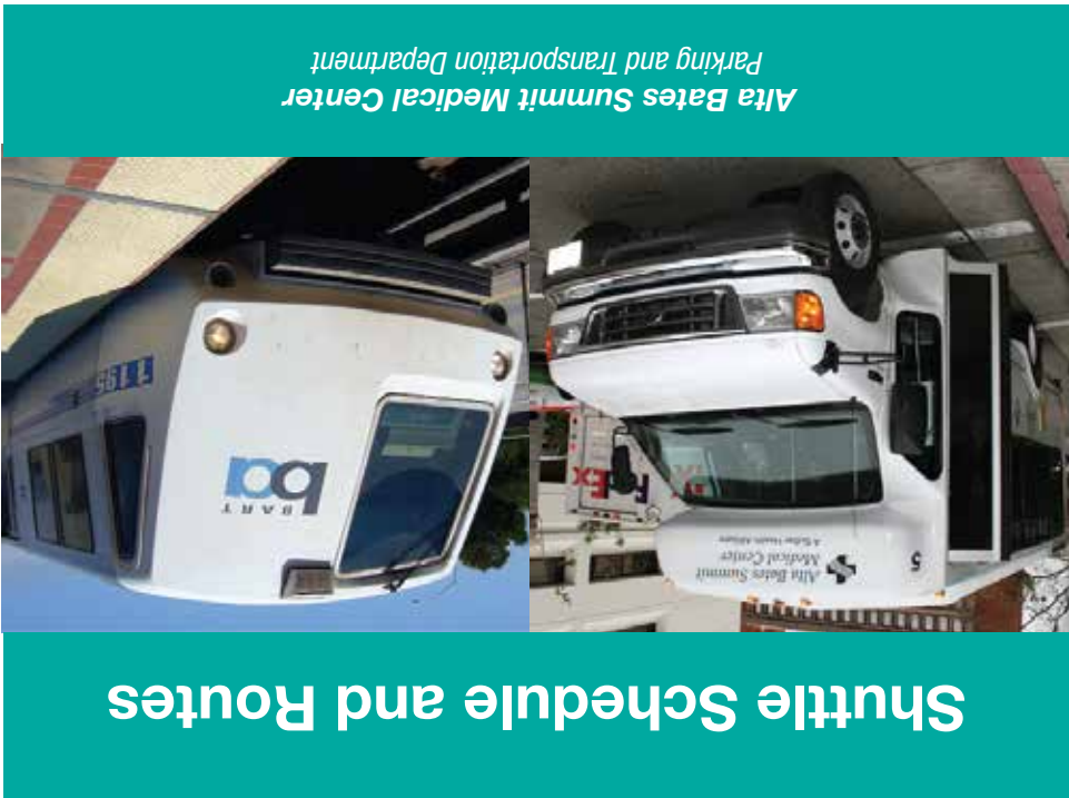
Alta Bates Summit Medical Center Parking and Transportation Department